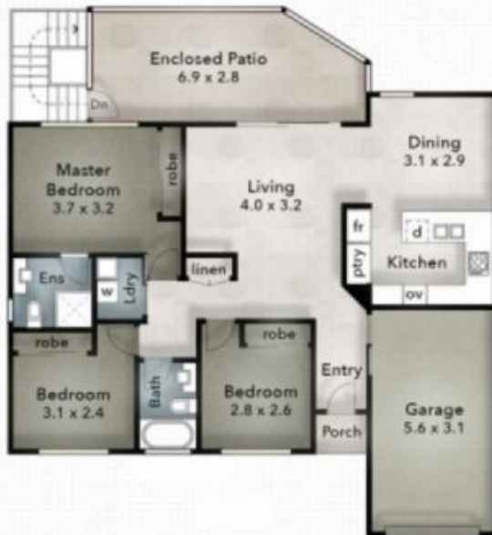
FLOOR PLAN // First Floor

3 Bedrooms | 2 Bathrooms | 1 Car Internal 112m 2 | External 42m 2 | Total 154m 2 or 17 Squares