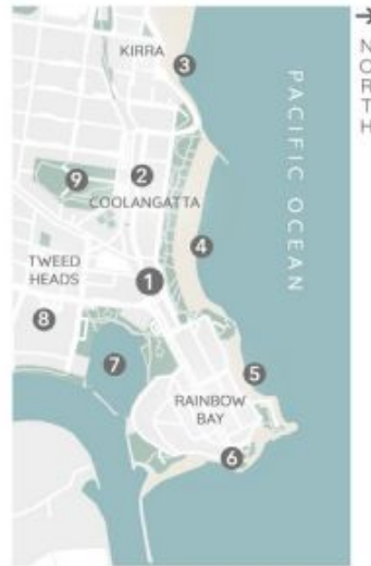
:: LOCATION MAP