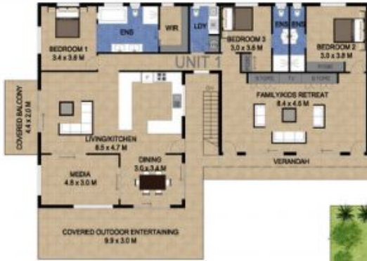
UPPER LEVEL UNIT 1