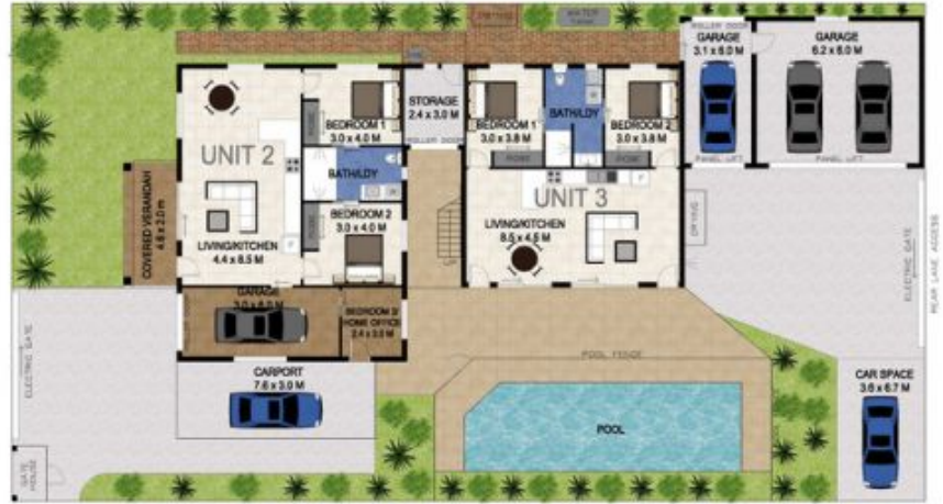
LOWER LEVEL UNITS 2 & 3