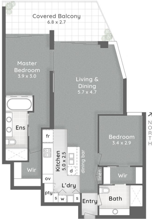
:: FLOOR PLAN Level 12 - 2.7m Ceiling